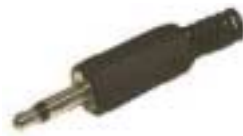
Figure 2. Picture of 3.5mm Mono Plug

Use a 3.5mm Mono Plug, to connect IR signals to the RadianceXD, as shown in Figure 2. A 1/8" Mono Plug will also work. Do not use a stereo plug.